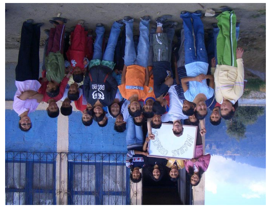
THANKS! from Students and Volunteers of Proyecto La Pedrera

La Pedrera is an indigenous community located on the rocky hills of Quetzaltenango, Guatemala. The people of La Pedrera moved from their pueblos to the near-city community looking for work and opportunities hoping to better their lives. Most adults speak the indigenous language k'iche' as their mother tongue, while their children often only speak Spanish.